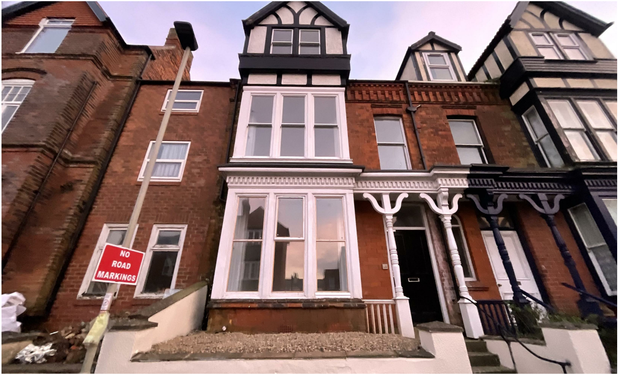
2 Lonsdale Road, Scarborough YO11 2QY £1,400